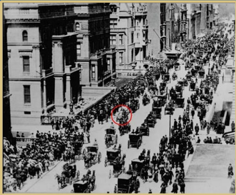
Easter morning 1900: 5th Avenue, New York City.