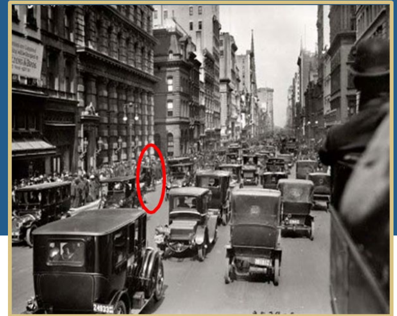
Easter morning 1913: 5th Avenue, New York City.